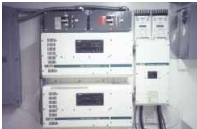
Power panel #2 for 32 PV panels and the wind generator.

My expectations for the adequacy of documentation were not met. I had to rely on significant verbal communication with the manufacturers. In general, the installation and operation manuals were incomplete. At worst they were inaccurate and inconsistent. The manuals appear to be more a reference for experienced installers rather than what is needed for the first or only time installer.