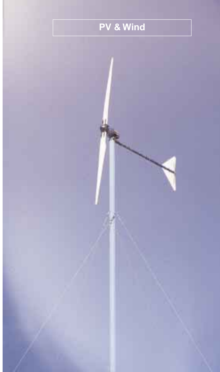
After some initial difficulties, the modified World Power Whisper H4500 is a viable addition to the system.

Thirty-two Kyocera 120 watt solar-electric panels complement the wind generator's energy production. PV output is regulated by two Trace C40 charge controllers. We opted for a Trace Power Panel