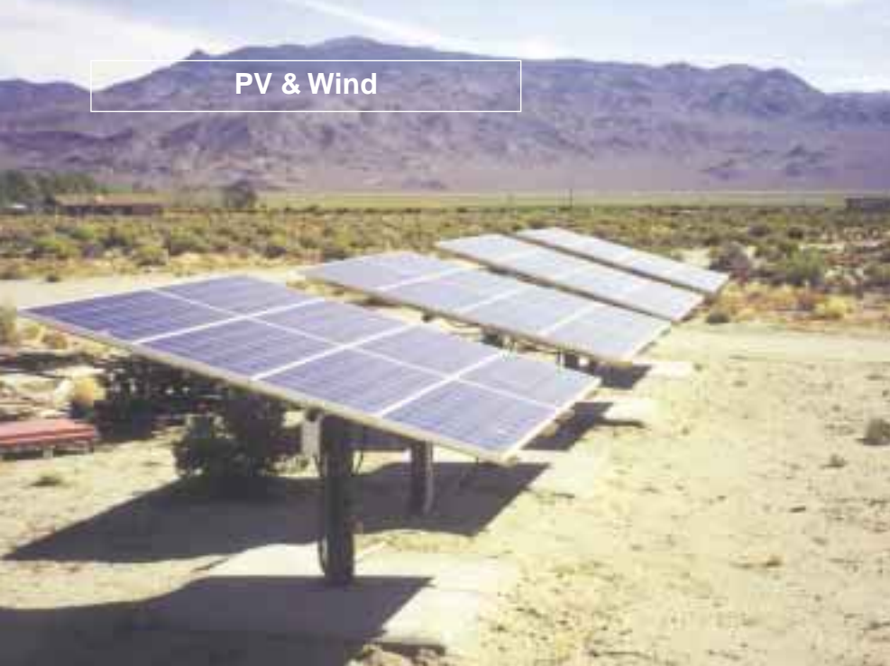
Thirty-two of the ninety-six PV panels are on stationary mounts.