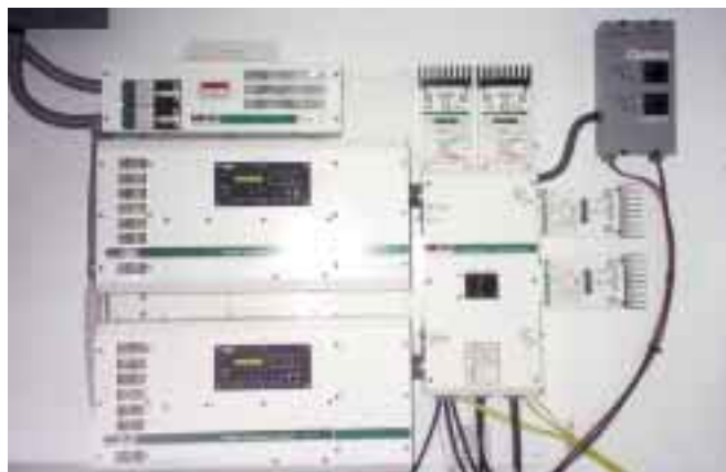
Power panel #1 for 64 PV panels.

should be used to double-check the set points. This way the inverters and charge controllers are regulating based on identical set points.