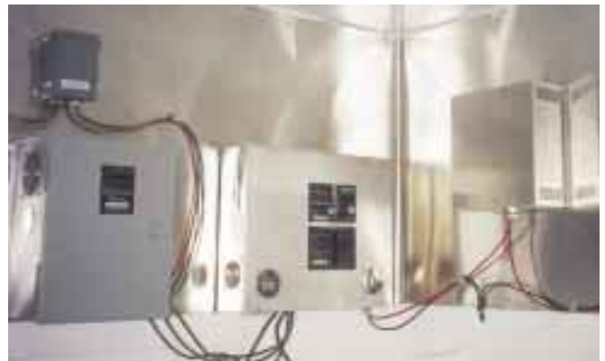
The Whisper EZ-Wire Center, step-down transformer, and diversion load heater box in the power room.

Photovoltaic panels are much easier to install than a wind generator, although the cost per watt is still higher. The construction cost for schedule 40 pipe, concrete, etc. is still significant for a PV mount. Trackers can be a worthwhile investment, because over time, the increased output can more than recover the initial cost of the tracker.