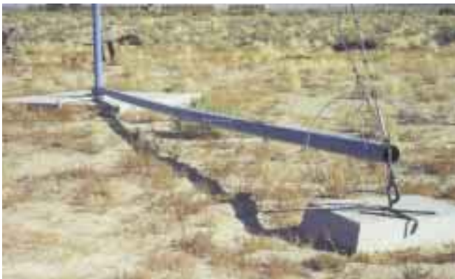
Sandy soil necessitated large concrete footings for the 70 foot tall tilt-up tower.

required for various tower heights and soil conditions. Why is this important? Putting the concrete in and getting the schedule 40 pipe cost nearly the same as the wind generator.